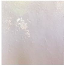
Concrete GFRC White