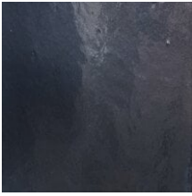
Concrete GFRC anthracite grey