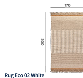
Rug Eco 02 White