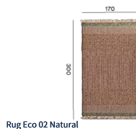
Rug Eco 02 Natural