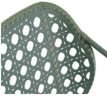
Wood Evolution Agate