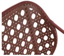
Wood Evolution Oxido