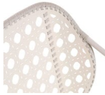
Wood Evolution Pearl