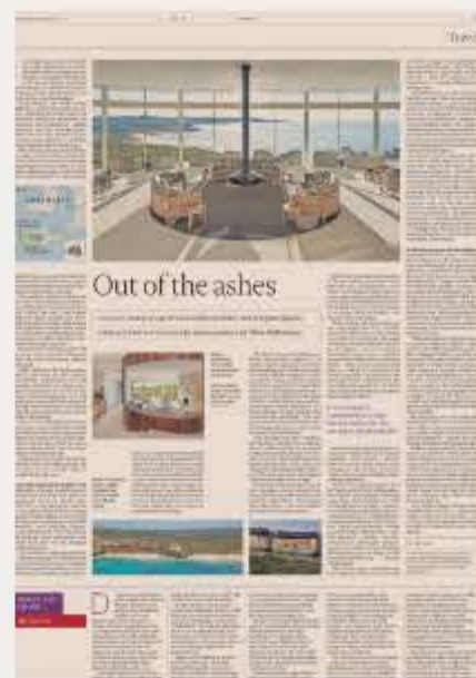
Financial Times (UK)