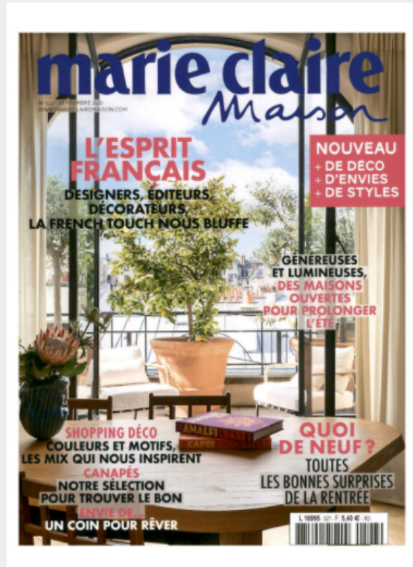
Marie Claire Maison (FR)