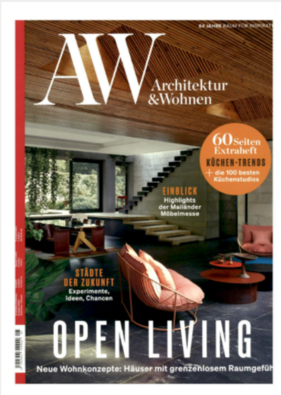
Architektur & Wohnen (DE)