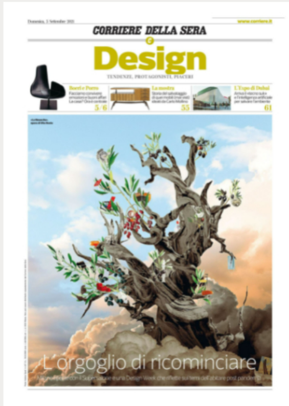
Corriere della Sera, Spec. Design (IT)